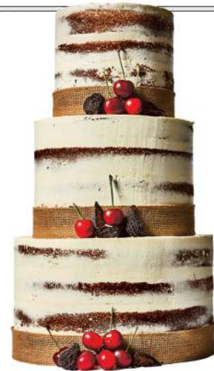
Semi-Naked Cake $10 per serving, by Sweet Corner Bakeshop.