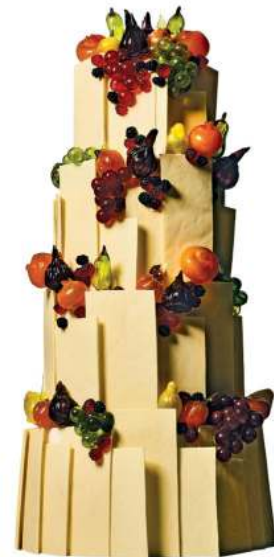
White-Chocolate Fruit Ambrosia $18 per serving, by Cake Alchemy.