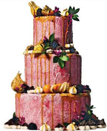
Crushed Blackberries $13 per serving, by Lael Cakes.